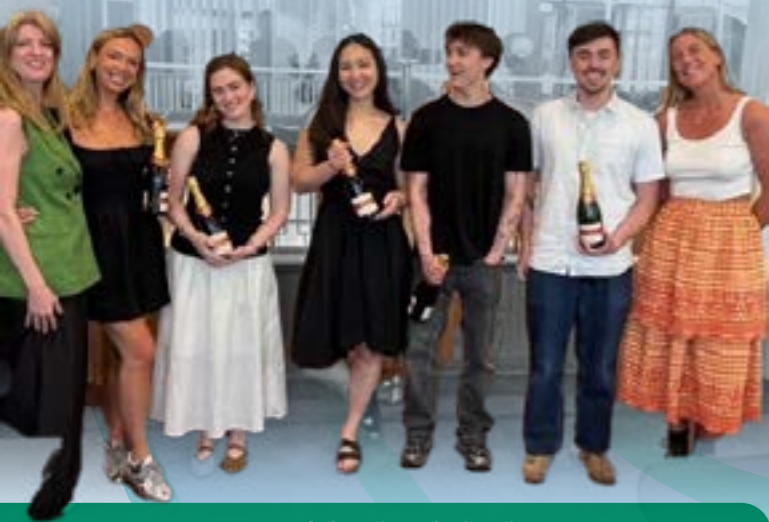
Team 'Atom' celebrating their win

The IPA and IDM accredited course ran in an in-person setting for six weeks, a highly pragmatic course during which we shared our 50 years of learning and many, many lived stories all in service of delivering best practice advice on how to smash a pitch process (or Level Up in new business).